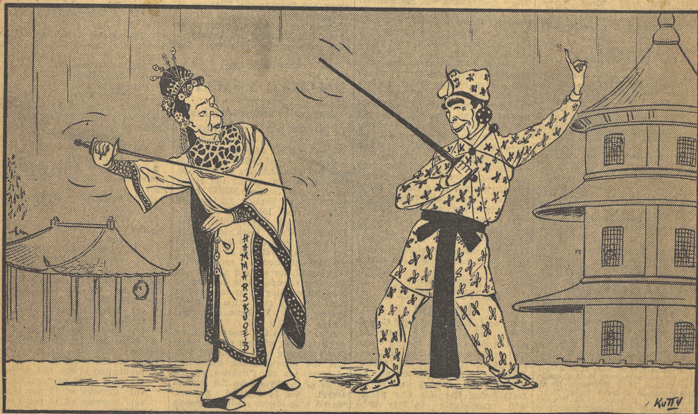
Mr. Dag Hammarskjöld is continuing his talks with Mr. Chou En-lai.