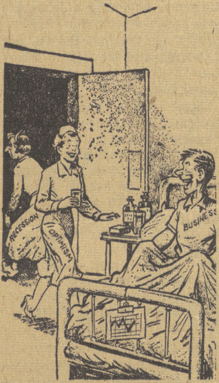
Jensen in The Chicago Daily News

ployment, they probably could never agree on what constitutes high wages.