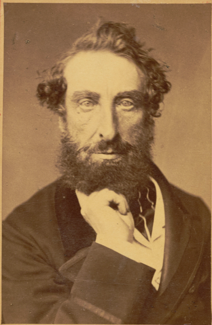
THE LATE LORD LYTTON